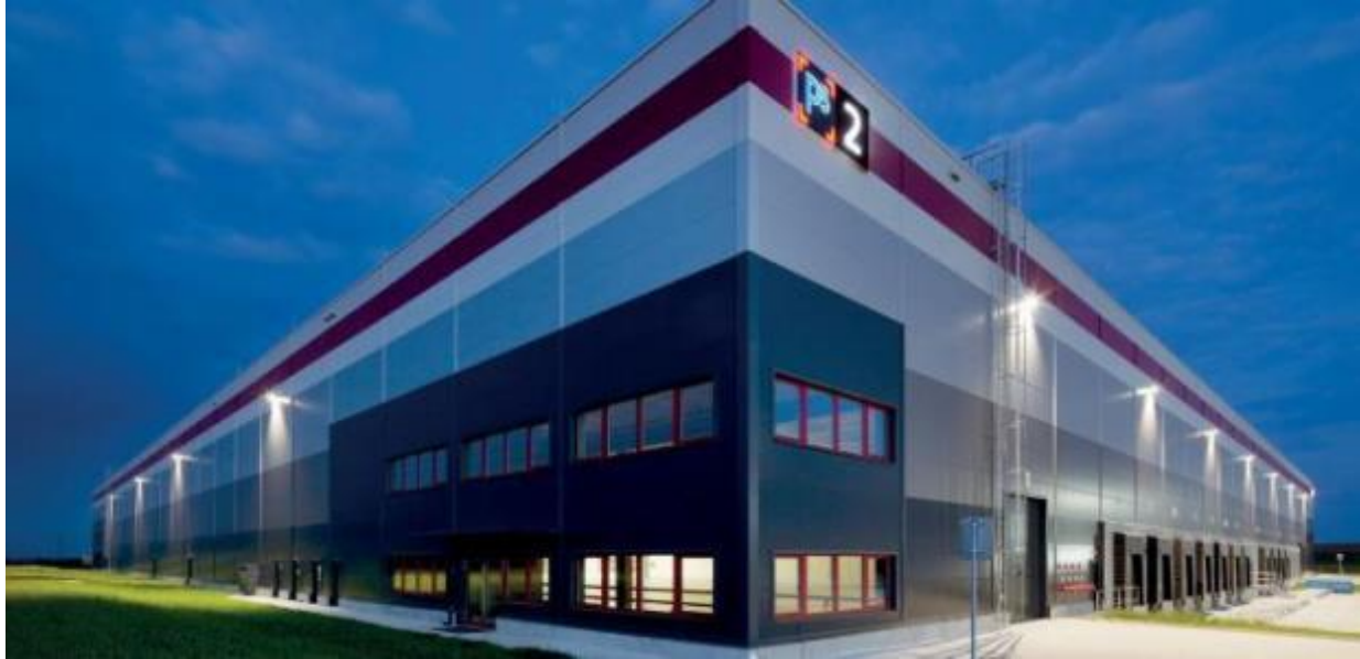
P3 Park Kosice